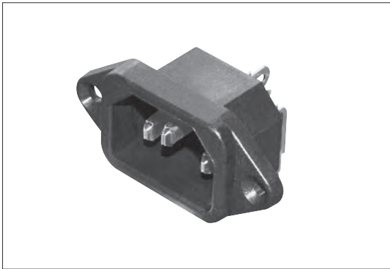
CCT2303-1401F 3P Inlet