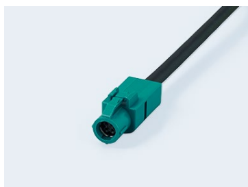
Cable Jack : CSS1004-50□□F