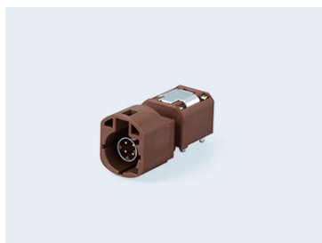
Plug(Right Angle Type) : CSC5004-5C□□F

□□ : Differs by key codes and colors. Please contact us for more information.