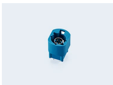
Plug(Vertical Type) : CSC5004-6C□□F